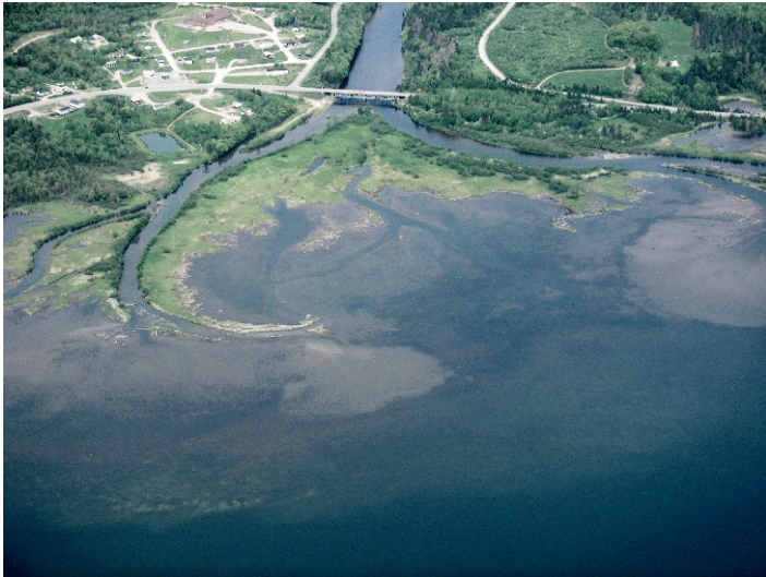
Photo 1 - Middle River as it enters the Bras d'Or Lake

As a Canadian society we are gradually becoming more knowledgeable about the importance of water through high profile issues such as: global impacts (climate change), selling our water (blue oil), contamination of water supplies (Walkerton), terrorism (911), impact by industrial legacies (Sydney Tar Ponds, Devco mine workings), and impact by flooding (during November and December of 2010). Yet the Bras d'Or Lakes watershed in large measure mirrors the rest of the country in the minimal emphasis placed to date on understanding the bigger issues. How much fresh water do we have? Where is it? How much is replenished each year? What is the quality of the water? How much must be left to sustain natural ecosystems? How does fresh water input impact coastal marine environments? The bottom line is: